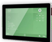
Room Sync Plus LED