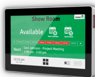
Room Sync Plus